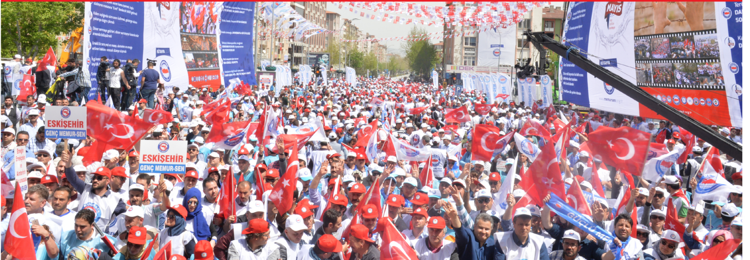
INTERNATIONAL LABOUR'S DAY GATHERING IN KÜTAHYA