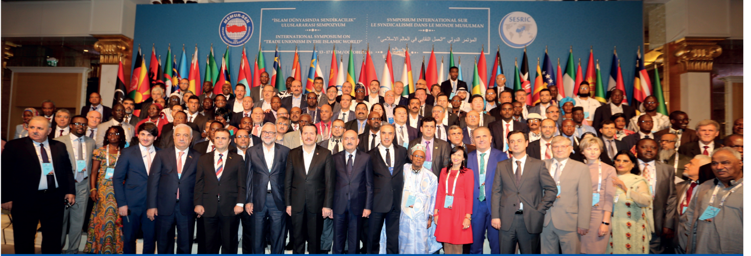
"TRADE UNIONISM IN THE ISLAMIC WORLD" INTERNATIONAL SYMPOSIUM STARTED

CONFEDERATION OF PUBLIC SERVANTS TRADE UNIONS