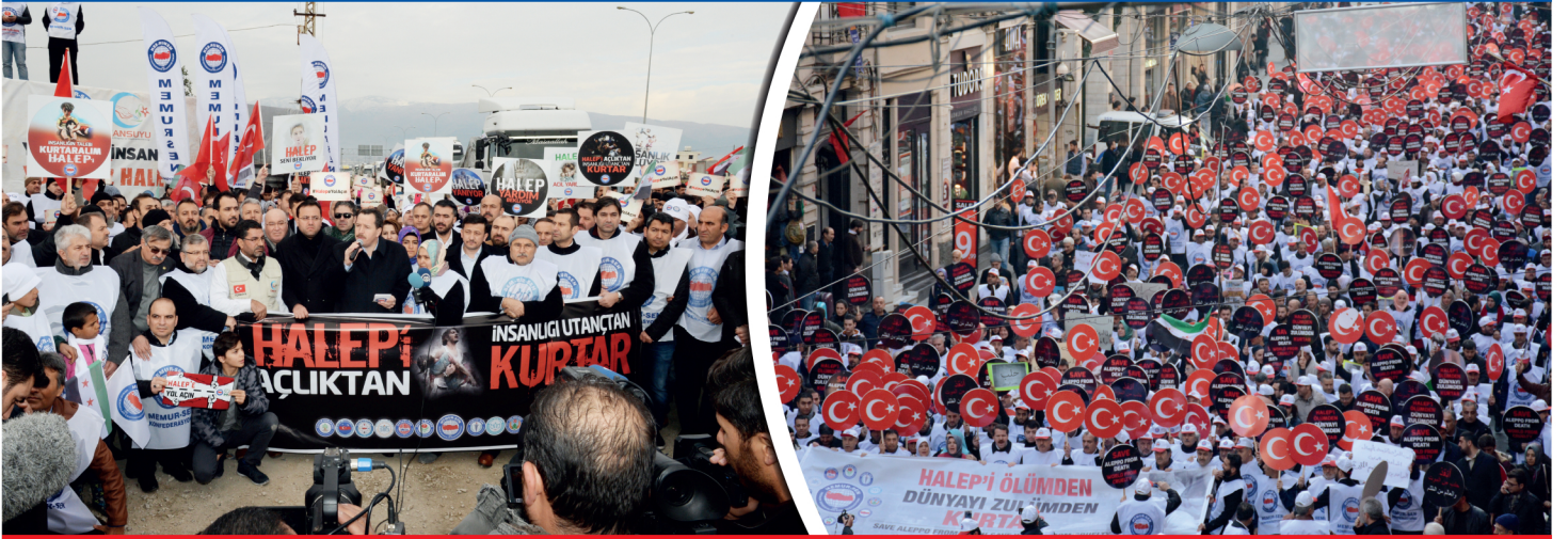
81 PROVINCES OF TURKEY STANDS FOR ALEPPO!